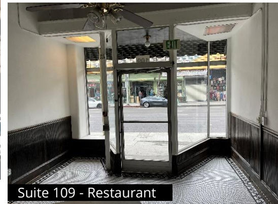
Suite 109 - Restaurant

The 8th & Main Street's brightly lit retail units are on the ground floor of a mixed-use property wedged between some of the most historic and dynamic neighborhoods of Downtown Los Angeles anchored by the Fashion, the Flower and the Jewelry Districts. It is home to some of the most trafficked, visited, and revered sites in all of Los Angeles with Santee Alley, the world-famous Apple Store at Tower Theater, the Ace Hotel and The Orpheum Theater all within a block or two. Foodie institutions such as Rossoblu, Sonoratown (tacos), and Polanquito add to the neighborhoods standing as the place to be, shop, and eat in LA.