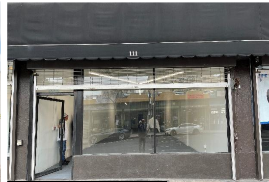
Suite 111 - Storefront