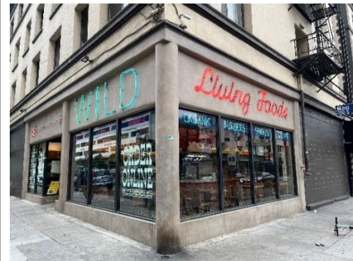
Wild Living Food Restaurant on corner

Dan Wakumoto Principal 213.471.1056 CalDRE #01315900 dan.wakumoto@avisonyoung.com