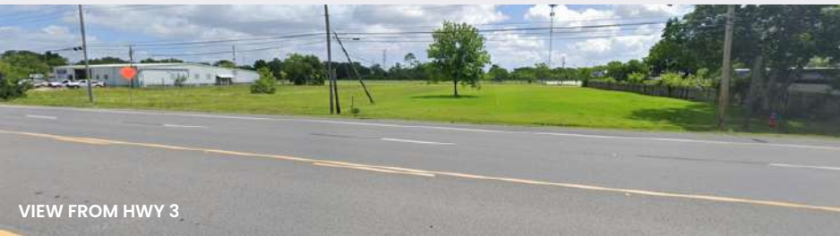
VIEW FROM HWY 3