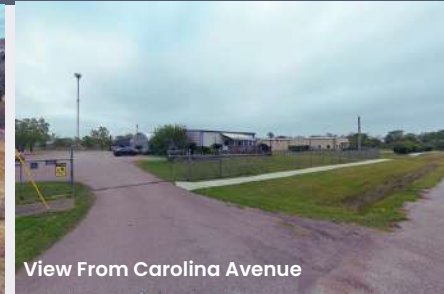
View From Carolina Avenue