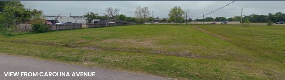
VIEW FROM CAROLINA AVENUE