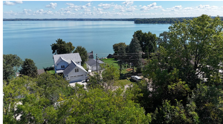
View looking Southeast over Lake Kegonsa