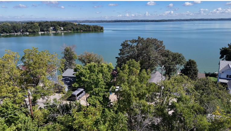
View looking Northeast over Lake Kegonsa