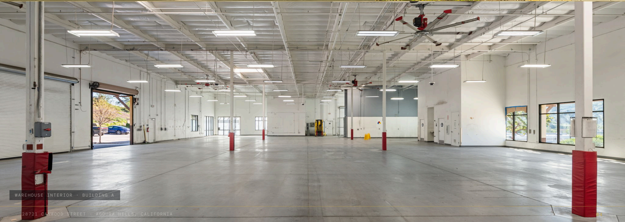
WAREHOUSE INTERIOR · BUILDING A