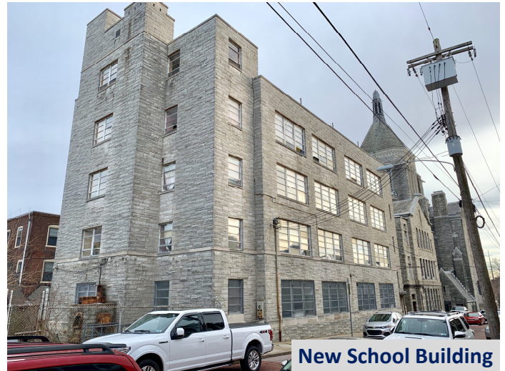
New School Building