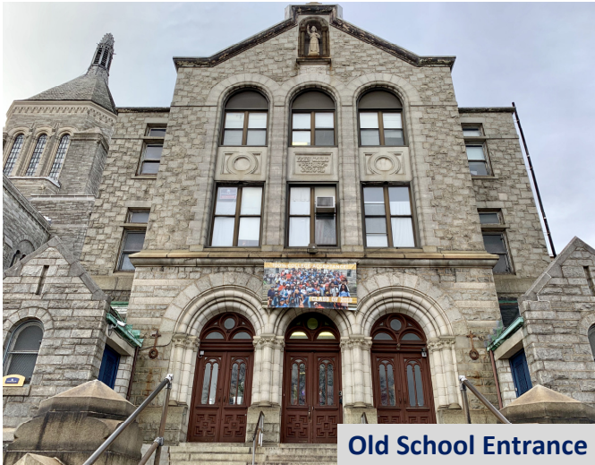
Old School Entrance