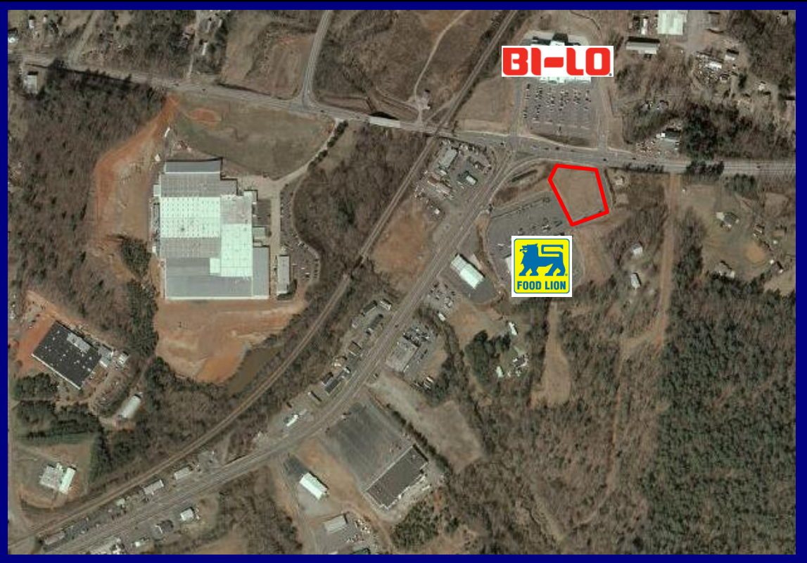
HWY 70 AND E. FLEMMING DRIVE, MORGANTON, NC