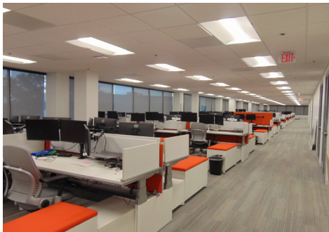
91 SIT/STAND DESK STATIONS