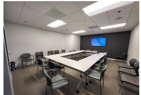
5 CONFERENCE ROOMS