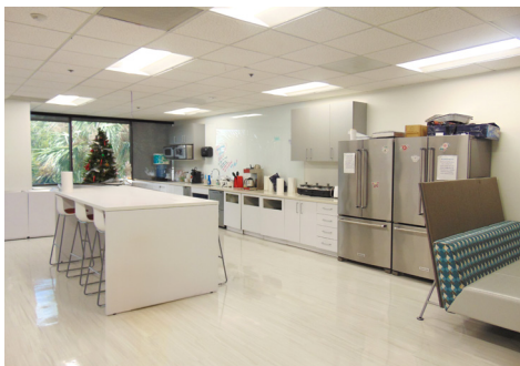
LARGE BREAK ROOM