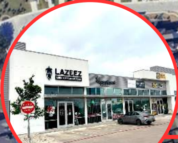
STONE OAK CENTER