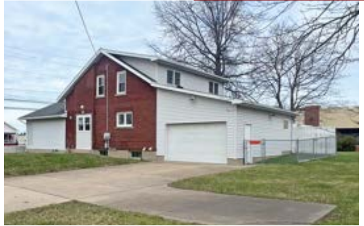
1-Car Attached Garage & Extra Parking