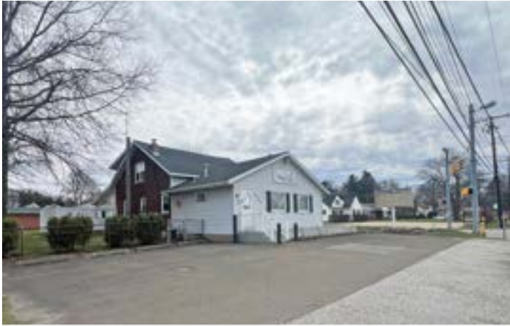
9-Car Parking Lot & View Of Side Yard

For Sale | 3567 W. 26th Street | Erie, PA 16506