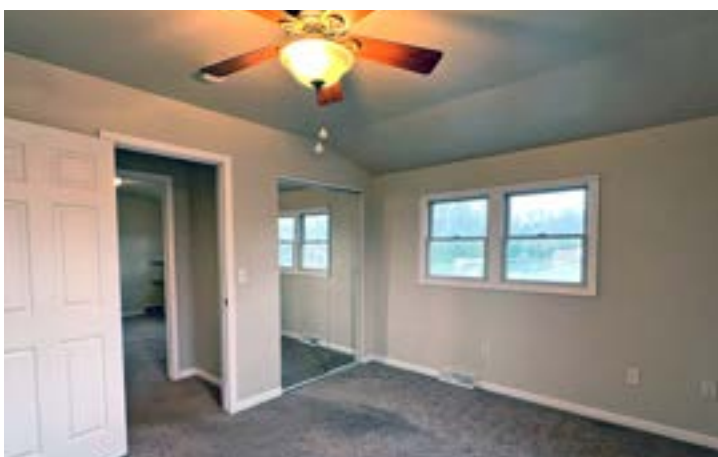
618± SF Second Floor With Full Bath - 1 Of 3 Bedrooms