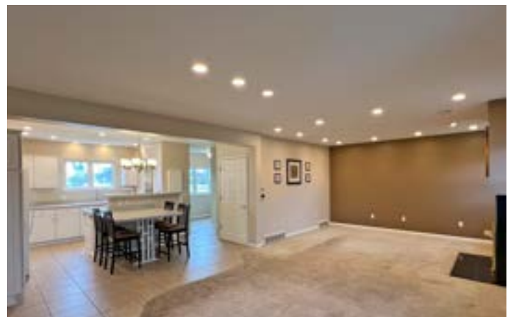
Potential For 1,441± SF First Floor Commercial Space