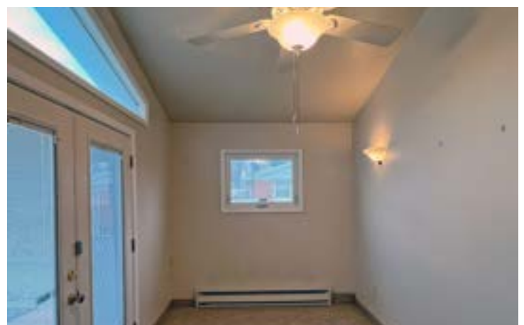
Sun Room Leads To Fenced Patio & Side Yard