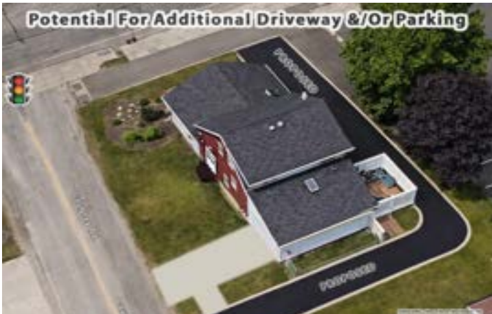
Potential For New Owner To Add Additional Driveway