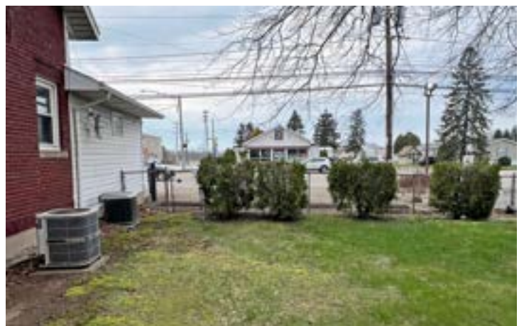
Side Yard - Both Units Include Central AC & Separately Metered Electric