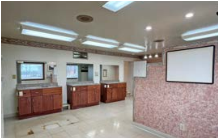
512± SF Storefront, Former Salon, With 9-Car Parking Lot