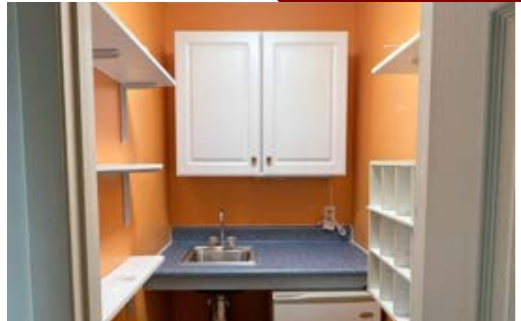
512± SF Storefront - Kitchenette