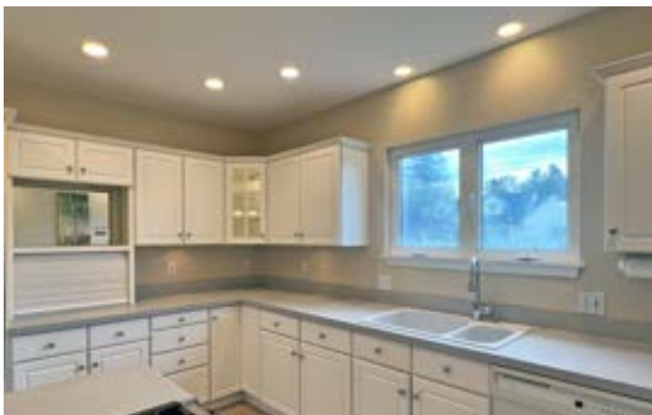
1,547± SF 3 Bedroom, 1.5 Bathroom Residence