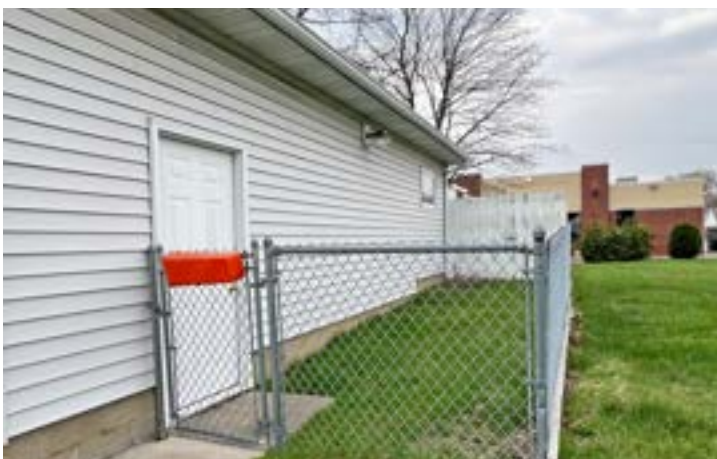
Fenced Dog Run