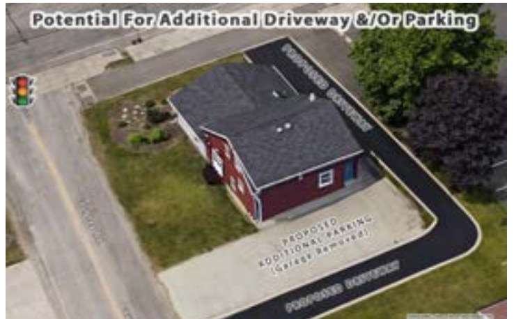
Potential For Additional Parking - Garage & Sun Room Removed