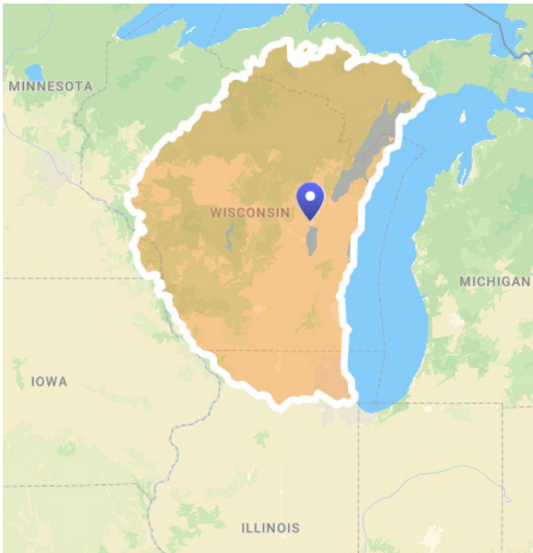
Highlighted portion of the map represents 200 mile commute from facility.