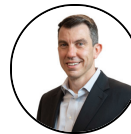
JOHN-PAUL WOLFE FRIEDMAN REAL ESTATE MANAGEMENT TN LLC