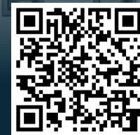
3d Video Tour