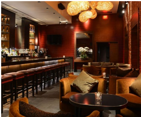
📍 NOBU | 903 N LA CIENEGA BLVD