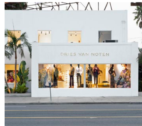
📍 DRIES VAN NOTEN | 451 N LA CIENEGA BLVD