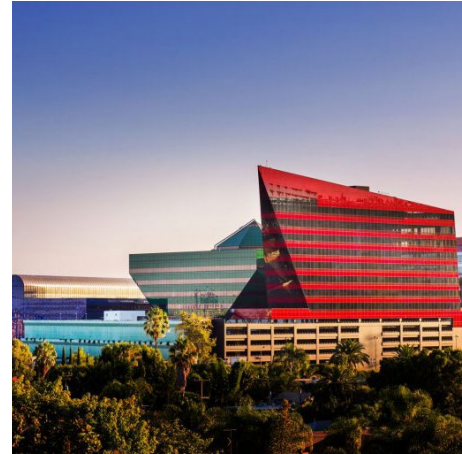
📍 PACIFIC DESIGN CENTER | 8687 MELROSE AVE