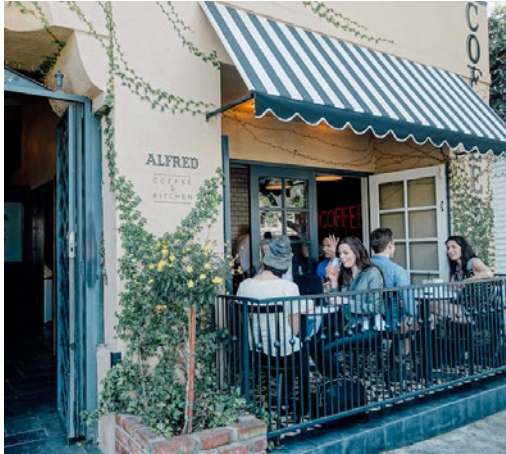
📍 ALFRED COFFEE | 8509 MELROSE PL

537 N LA CIENEGA BVD, WEST HOLLYWOOD, CA 90048