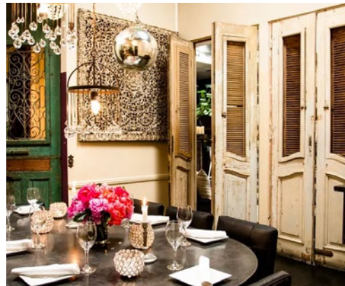
📍 SUR RESTAURANT | 606-614 N ROBERTSON BLVD