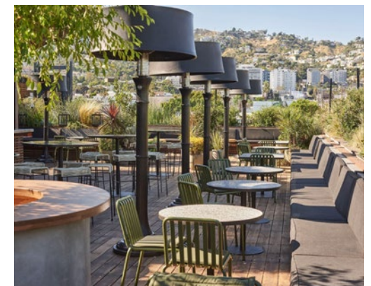
📍 E.P. & L.P. | 603 N LA CIENEGA BLVD