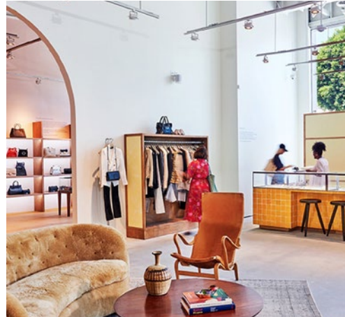
📍 THE REALREAL | 8500 MELROSE AVE