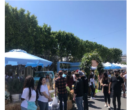
📍 MELROSE PLACE FARMERS MARKET