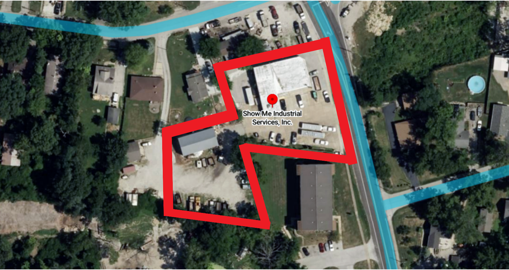
Show Me Industrial Services, Inc.