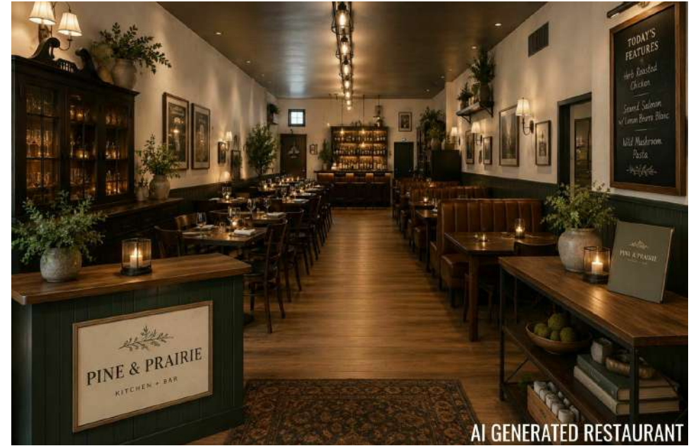
AI GENERATED RESTAURANT