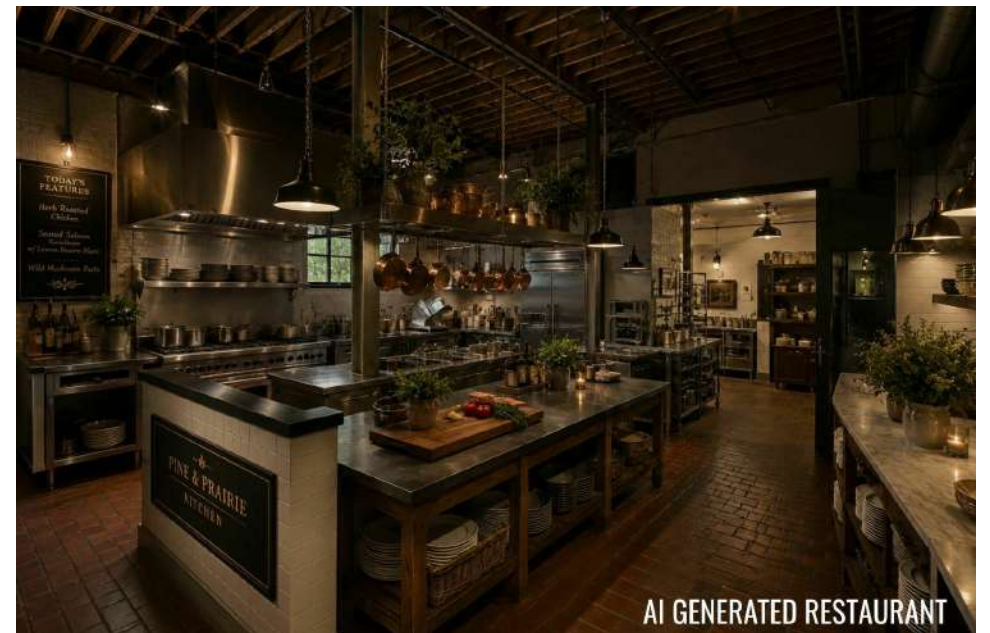
AI GENERATED RESTAURANT