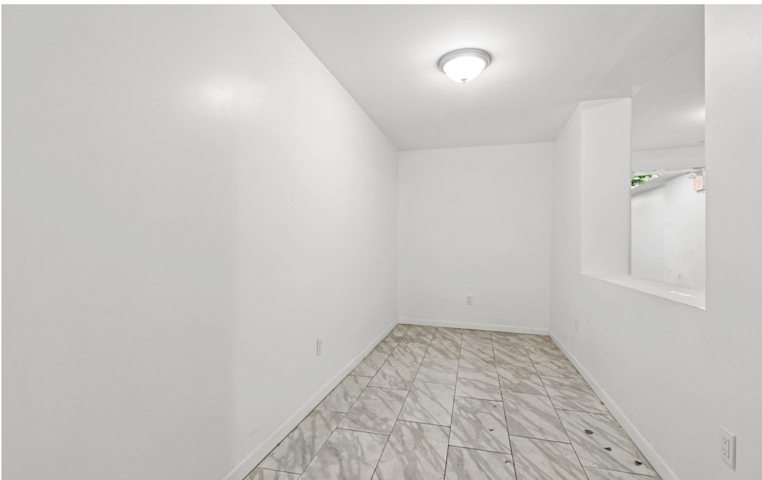
Bathroom – modernized clean finish