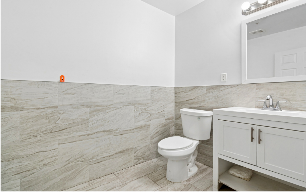
Private Room – staged as grooming / treatment room