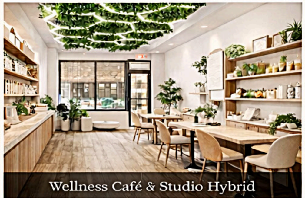
Wellness Café & Studio Hybrid

Position your brand in the heart of Fort Greene.