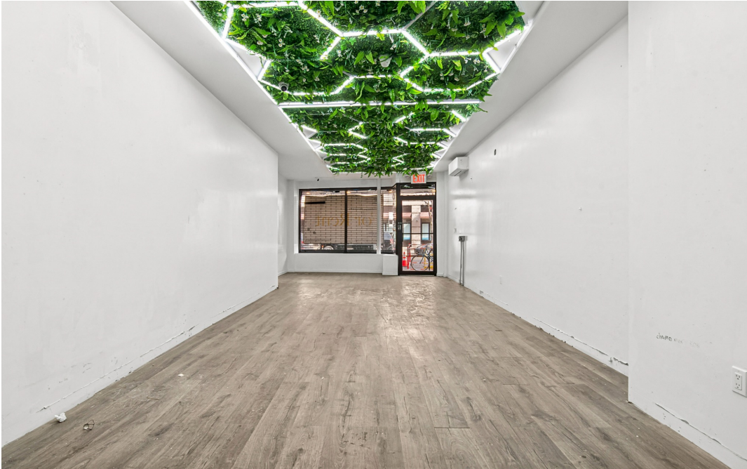
Front Retail – staged as wellness café / boutique