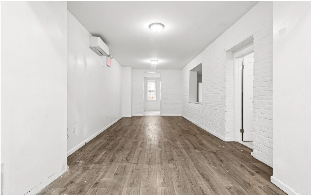
Interior Depth – staged as bakery seating & counter