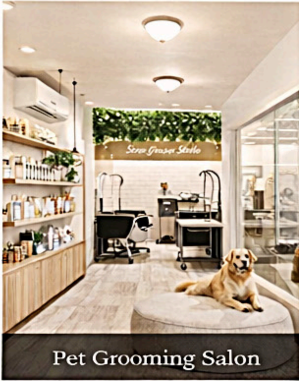
Pet Grooming Salon

Prime Fort Greene / Clinton Hill Retail Opportunity