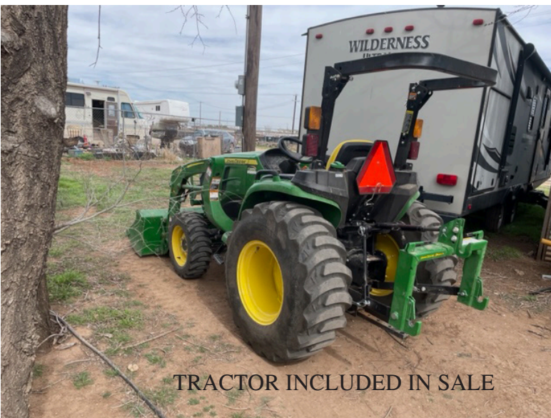
TRACTOR INCLUDED IN SALE