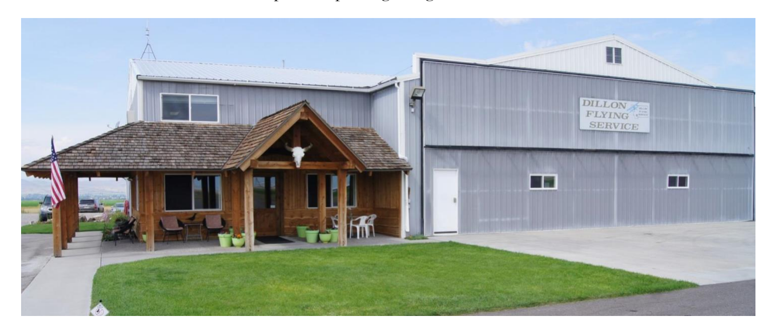
More information on airport operations, communications and service can be obtained from www.dillonflyingservices.com

Dillon Flying Service is a private airstrip capable of handling private and corporate jet aircrafts. The runway is 6,500 ft and the airstrip offers parking, hangars and fuel.