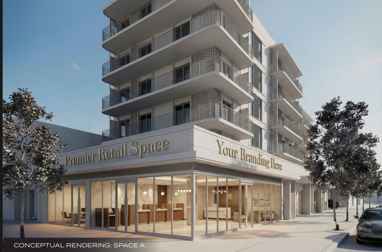
CONCEPTUAL RENDERING: SPACE A