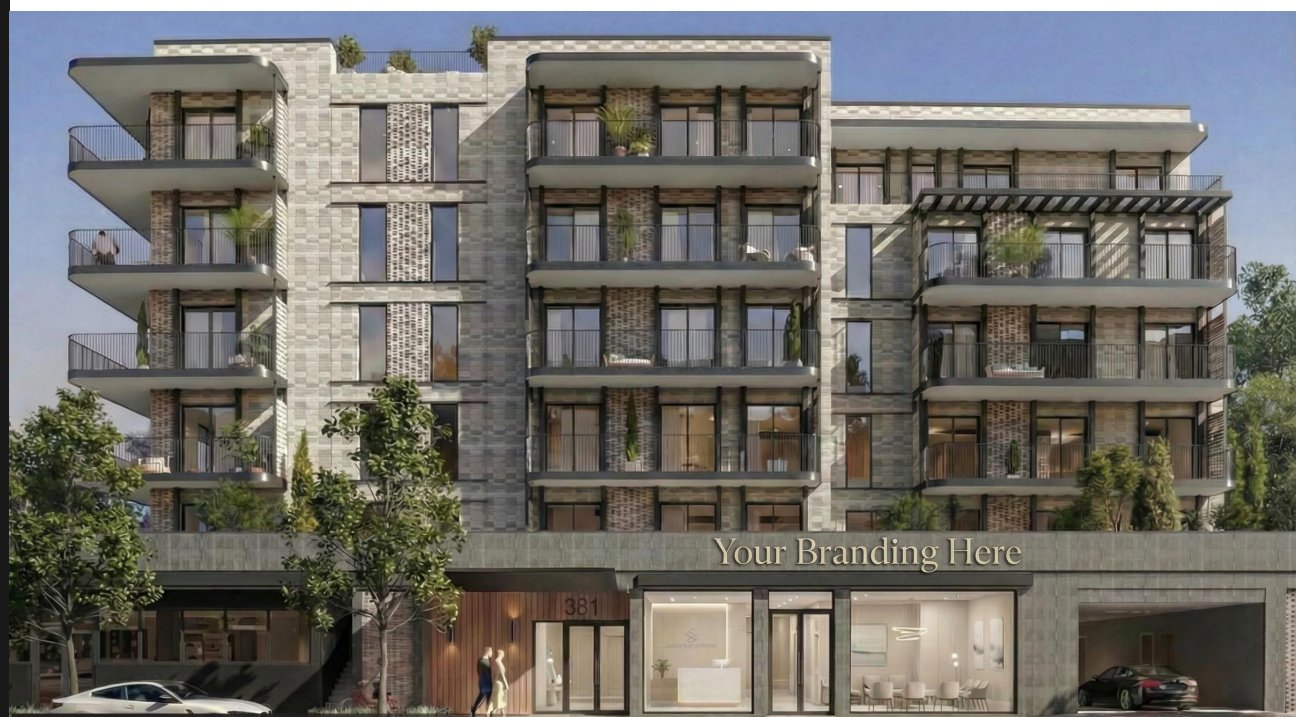
CONCEPTUAL RENDERING: SPACE B