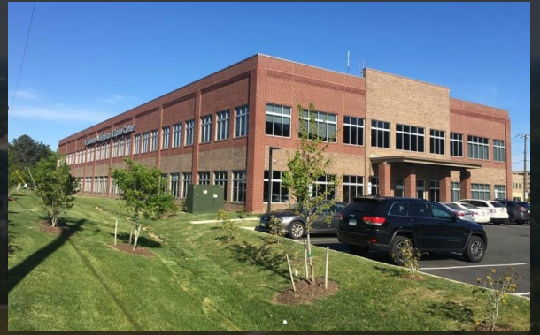
Prospective site rendering