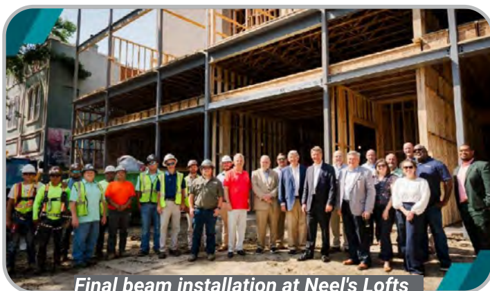
Final beam installation at Neel's Lofts