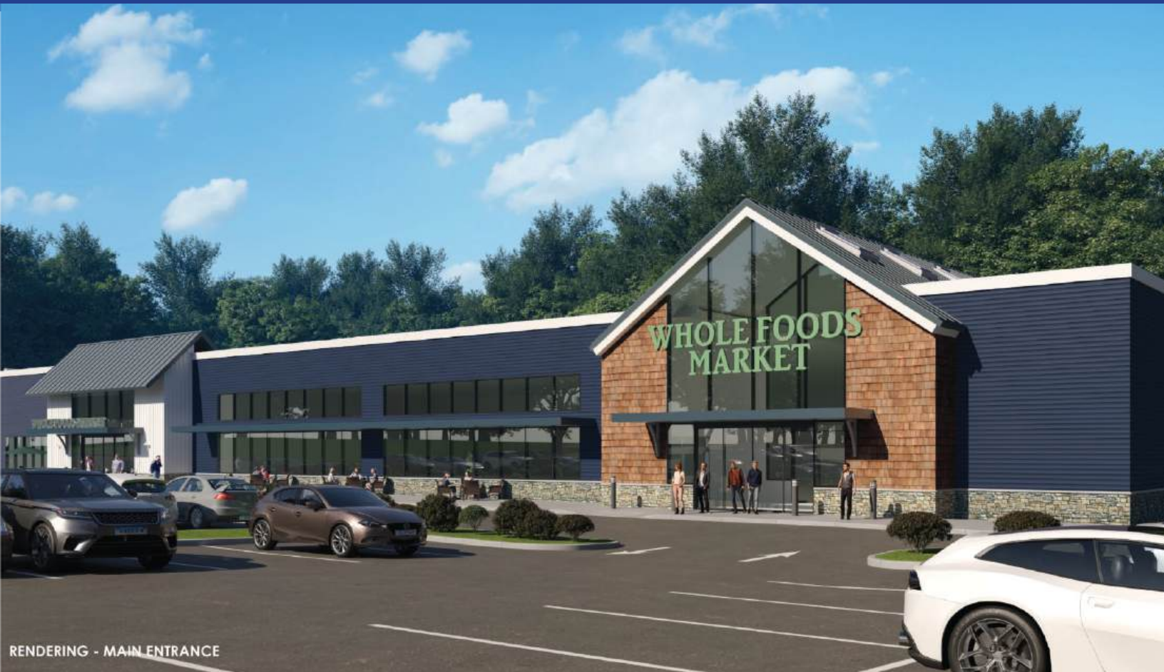
RENDERING - MAIN ENTRANCE

1654 BOSTON POST ROAD, OLD SAYBROOK, CONNECTICUT