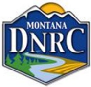
EXHIBIT # C