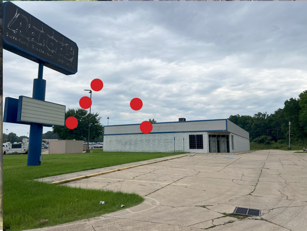
Brookshire's Grocery Anchored Shop 3000 N Market Shreveport, La.