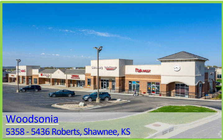
Woodsonia 5358 - 5436 Roberts, Shawnee, KS