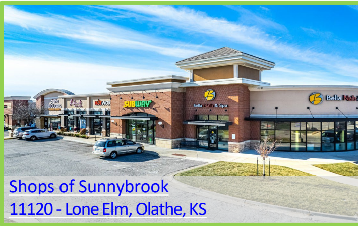
Shops of Sunnybrook 11120 - Lone Elm, Olathe, KS