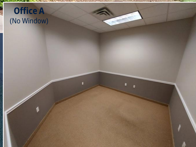
Office A (No Window)