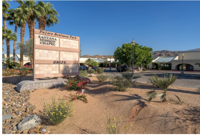
HIGHLY VISABLE SIGNAGE ON PEREZ RD