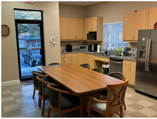
Kitchen / Break Room