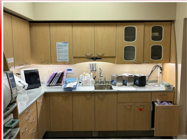
Lab / Tech