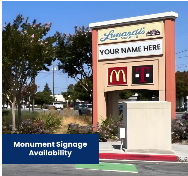
Monument Signage Availability