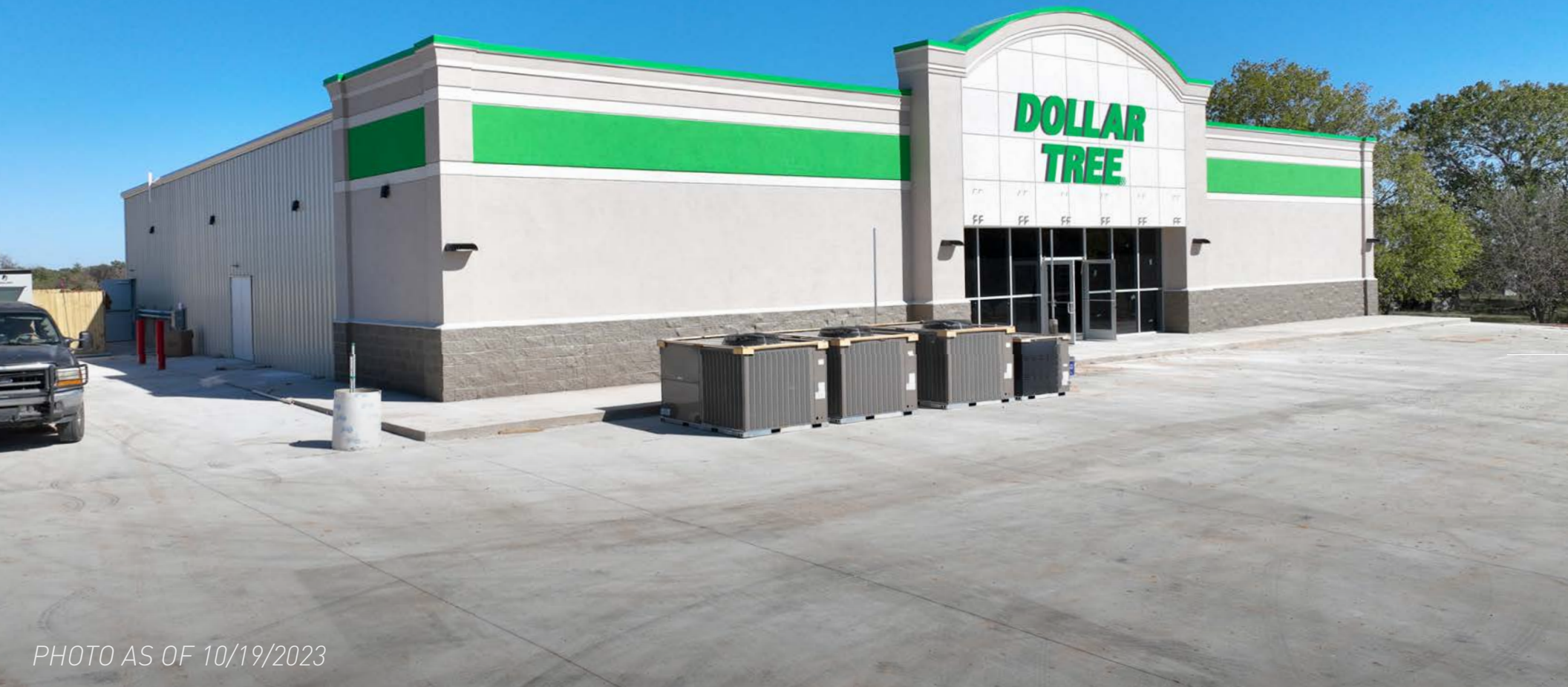
PHOTO AS OF 10/19/2023

3320 W HIGHWAY 199, SPRINGTOWN (DALLAS MSA), TEXAS