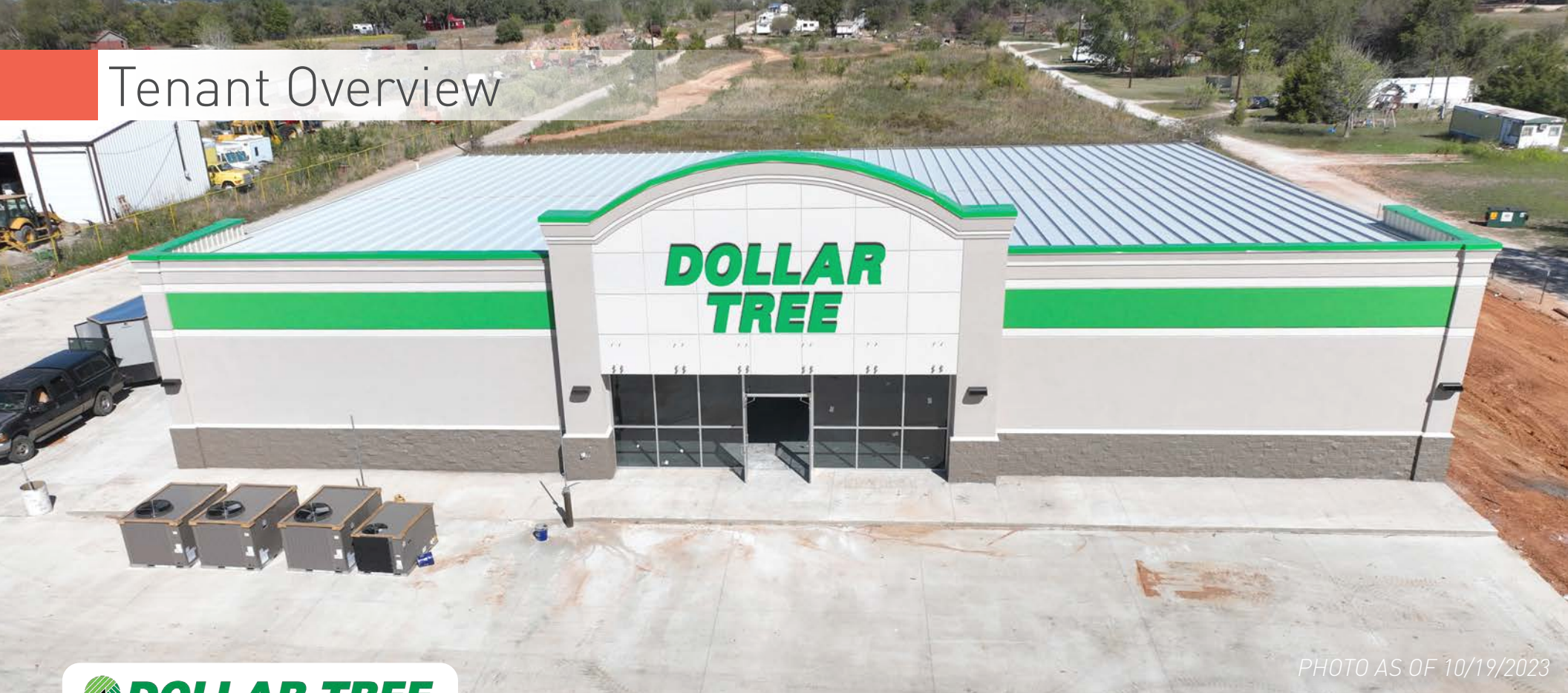
PHOTO AS OF 10/19/2023