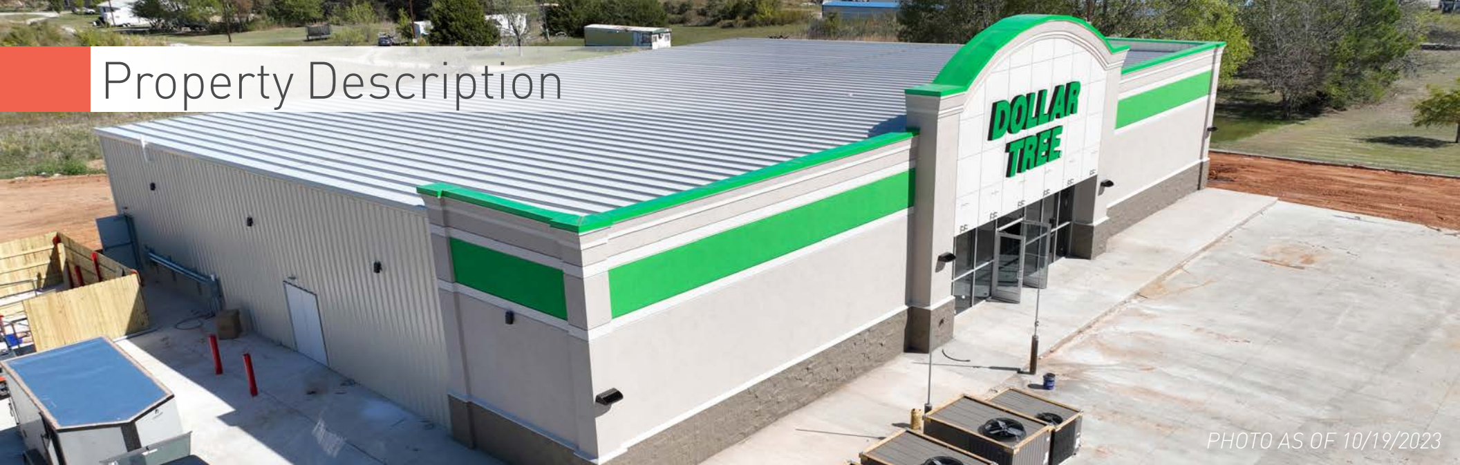
PHOTO AS OF 10/19/2023