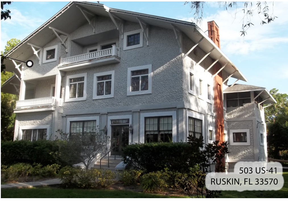
GFWC RUSKIN WOMAN'S CLUB (1912)