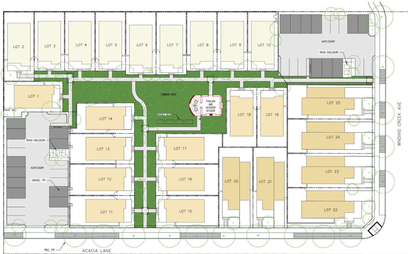
OVERALL SITE PLAN