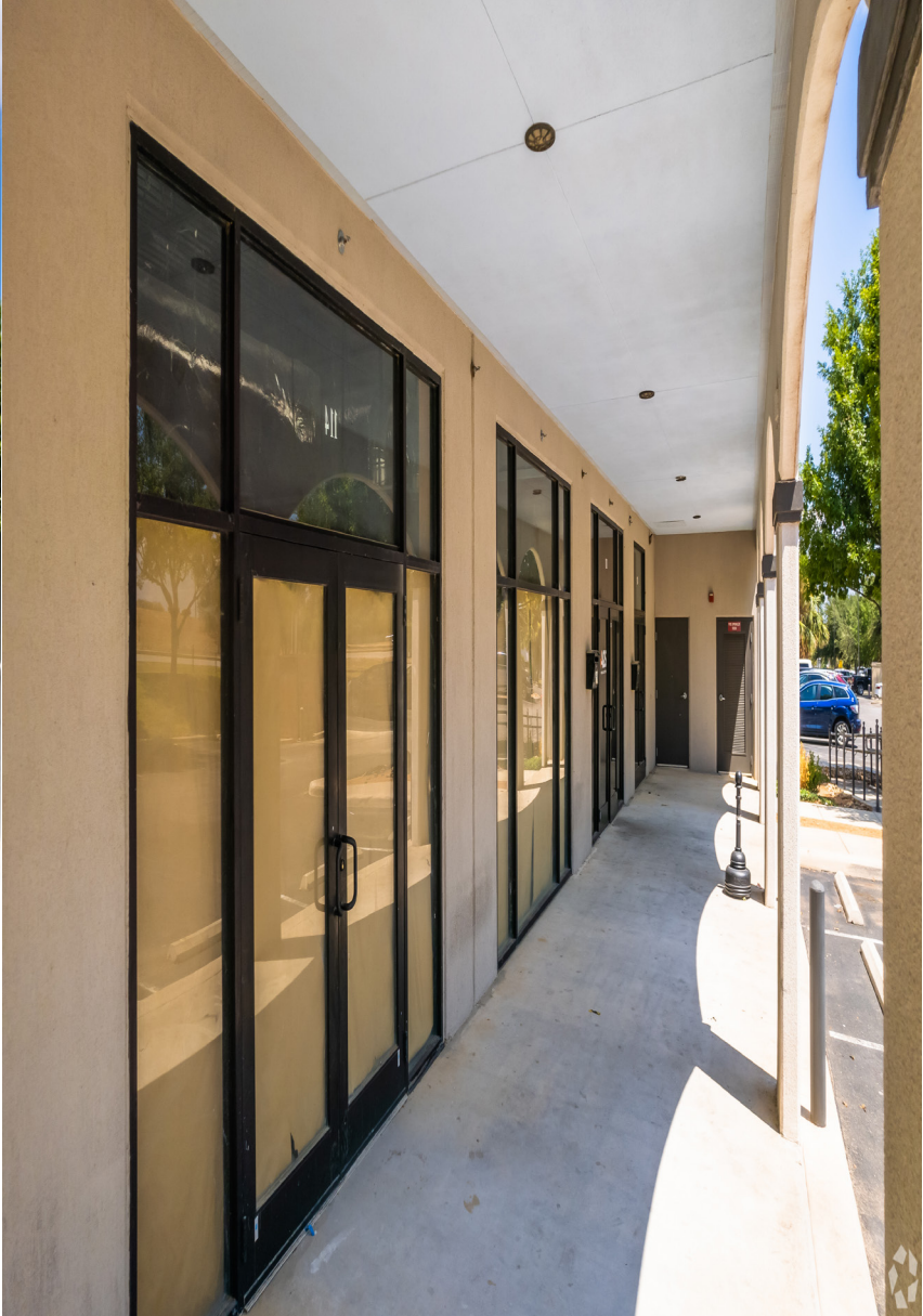
15511 Applewhite Rd., San Antonio, TX 782