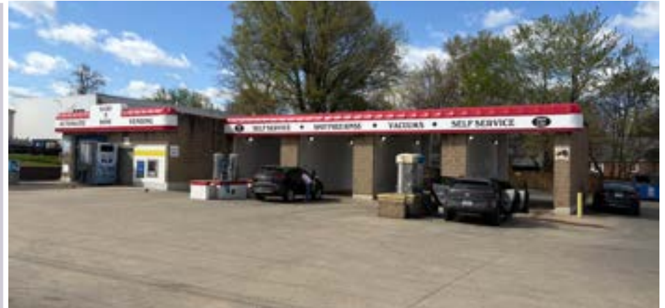
3028 POPLAR LEVEL ROAD, LOUISVILLE, KY 1 AUTOMATIC BAY / 4 SELF SERVICE BAYS BELANGER BRUSH