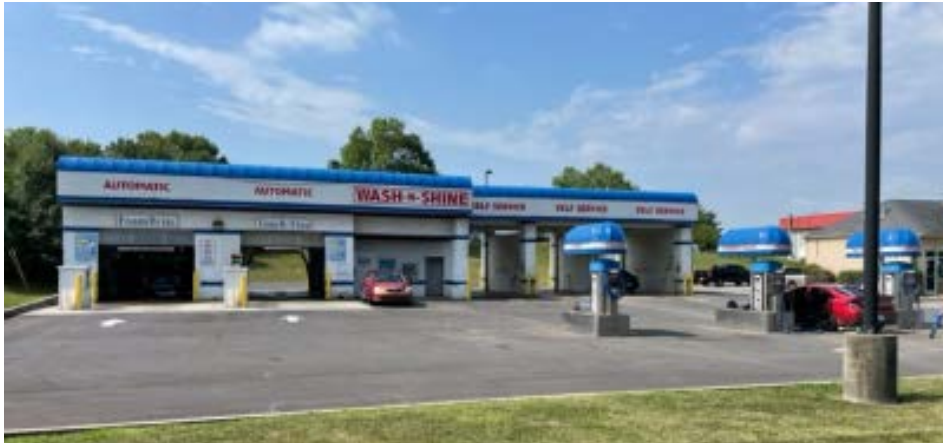
1888 MIDLAND TRAIL, SHELBYVILLE, KY 2 AUTOMATIC BAYS / 3 SELF SERVICE BAYS RYKO BRUSH AND BELANGER TOUCH FREE