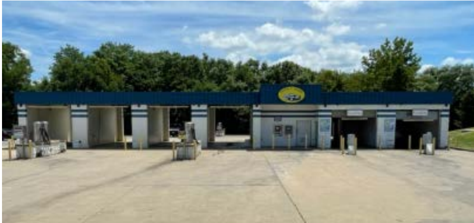
7610 HWY 311, SELLERSBURG, IN 2 AUTOMATIC BAYS / 4 SELF SERVICE BAYS RYKO BRUSH AND BELANGER TOUCH FREE