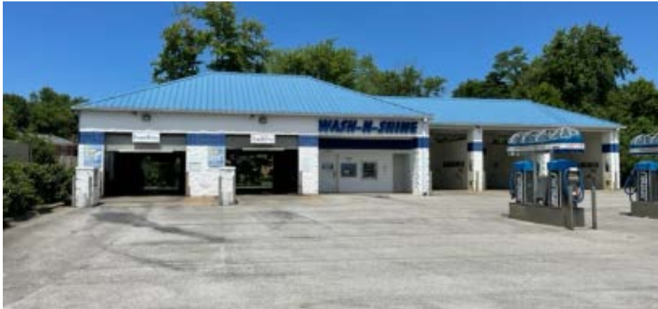
4207 CHARLESTOWN ROAD, NEW ALBANY, IN 2 AUTOMATIC BAYS / 3 SELF SERVICE BAYS RYKO BRUSH AND BELANGER TOUCH FREE