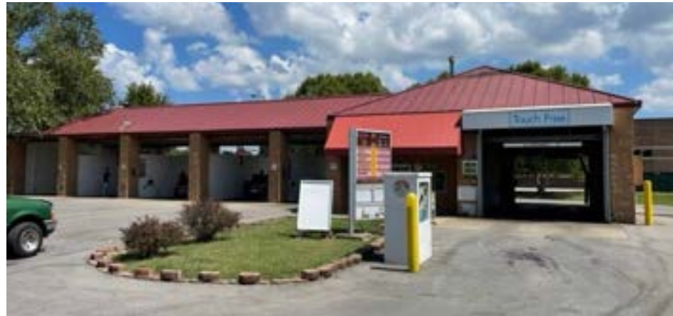
6500 GREENWOOD ROAD, LOUISVILLE, KY 1 AUTOMATIC BAY / 5 SELF SERVICE BAYS BELANGER TOUCH FREE AUTOMATIC