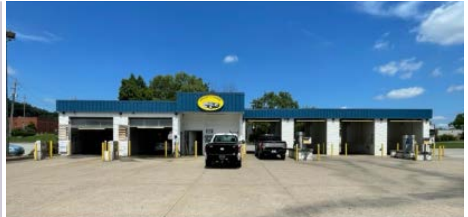
114 KNABLE LANE, NEW ALBANY, IN 2 AUTOMATIC BAYS / 4 SELF SERVICE BAYS RYKO BRUSH AND RYKO TOUCH FREE