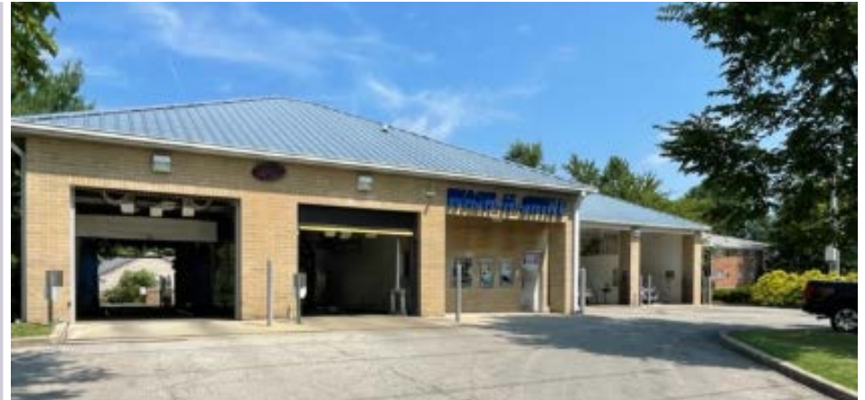
2911 HIKES LANE, LOUISVILLE, KY 2 AUTOMATIC BAYS / 3 SELF SERVICE BAYS MARK 7 BRUSH AND D & S TOUCH FREE