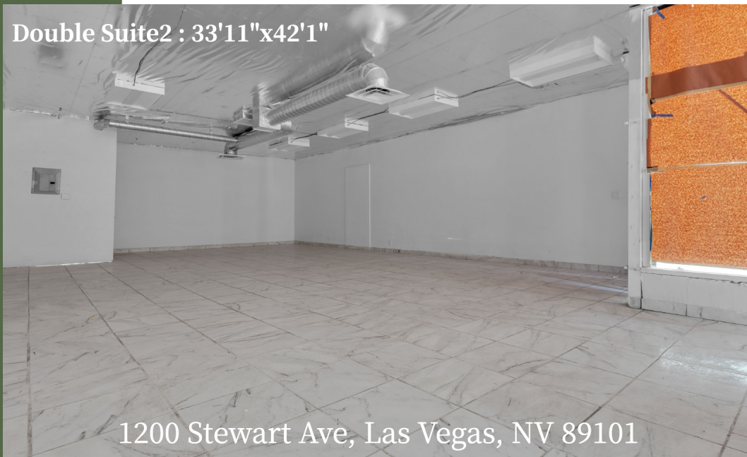
Double Suite2 : 33'11"x42'1"