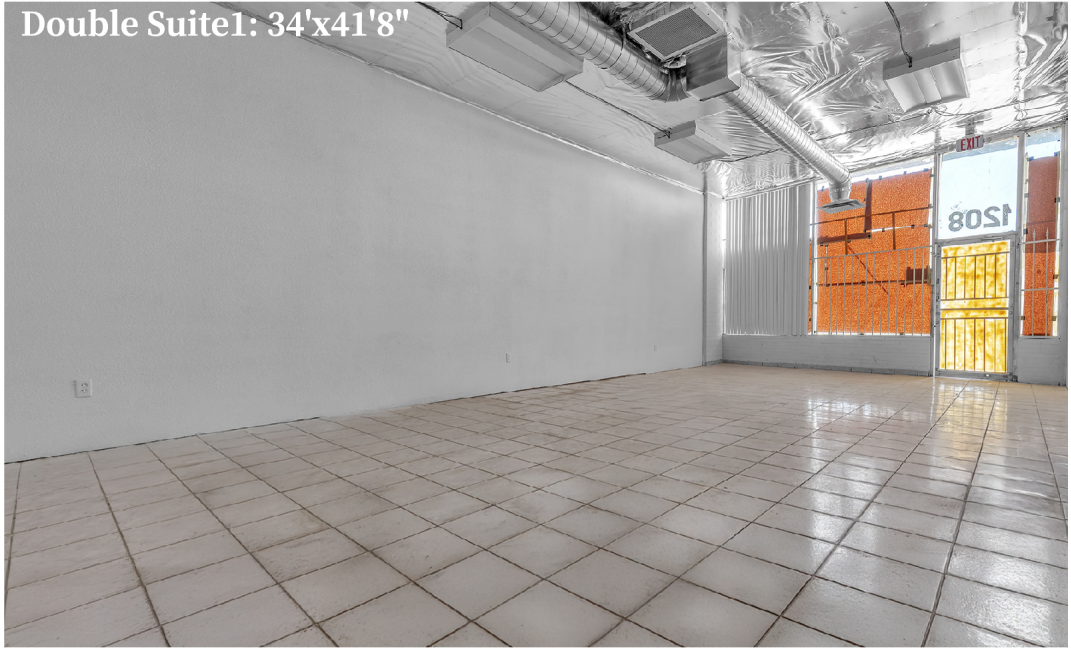
Double Suite1: 34'x41'8"