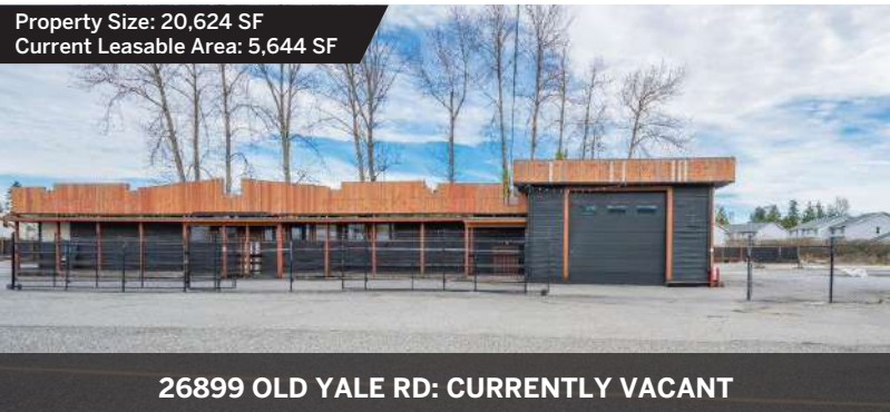
26899 OLD YALE RD: CURRENTLY VACANT

Property Size: 20,624 SF Current Leasable Area: 5,644 SF