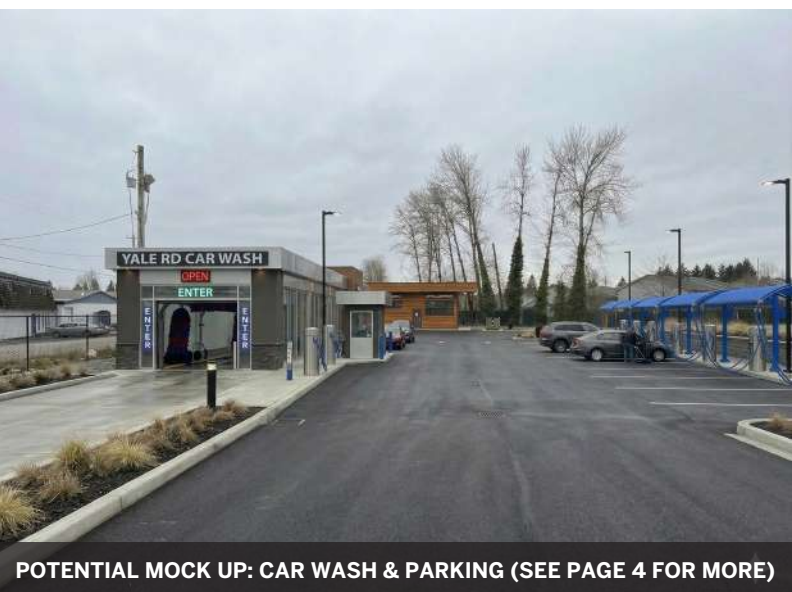
POTENTIAL MOCK UP: CAR WASH & PARKING (SEE PAGE 4 FOR MORE)

AREA: Aldergrove ADDRESS: 26899 + 26963 Old Yale Rd, Langley , BC SIZE: 1.44 Acres PRICE: $3,250,000