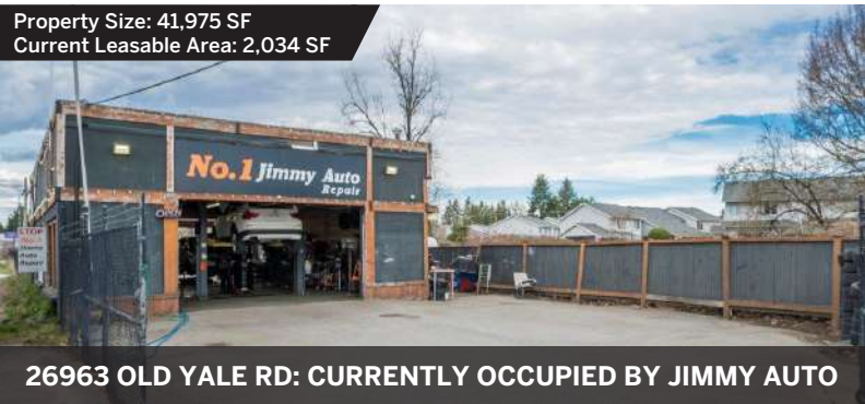
26963 OLD YALE RD: CURRENTLY OCCUPIED BY JIMMY AUTO

Property Size: 41,975 SF Current Leasable Area: 2,034 SF