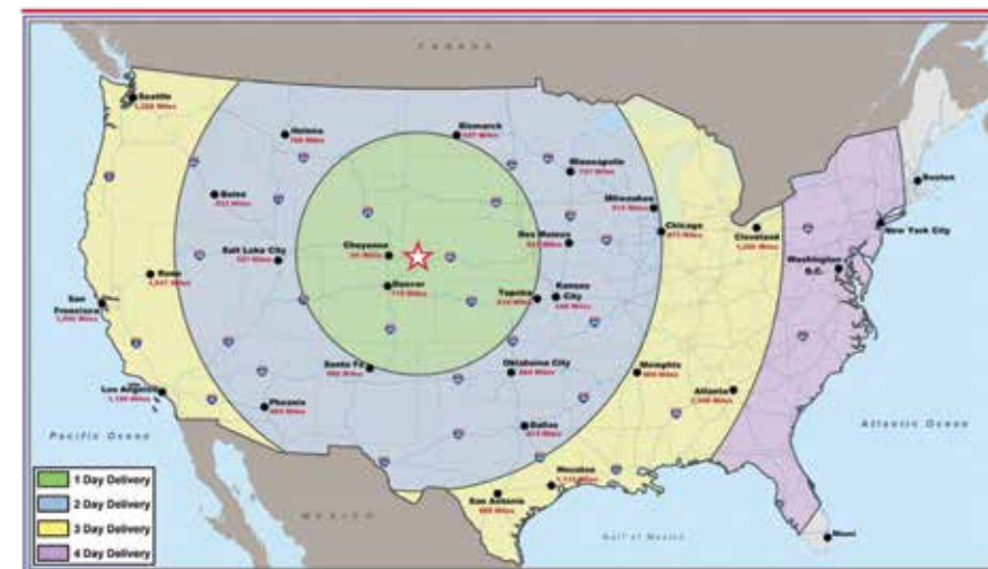
Trucking Times From Adams Industrial Park