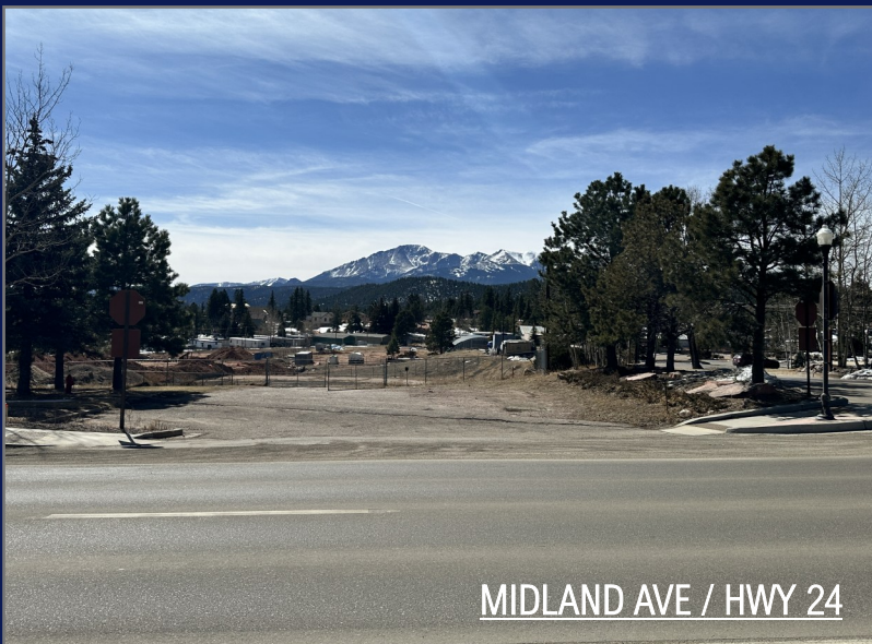
MIDLAND AVE / HWY 24

All of the lots adjoin the Woodland Station Project and are connected by a City owned parcel that has been designated for public access