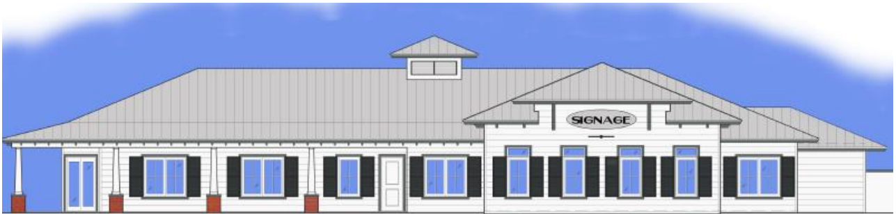
NORTH ELEVATION - EAST OCEAN BLVD. FRONTAGE