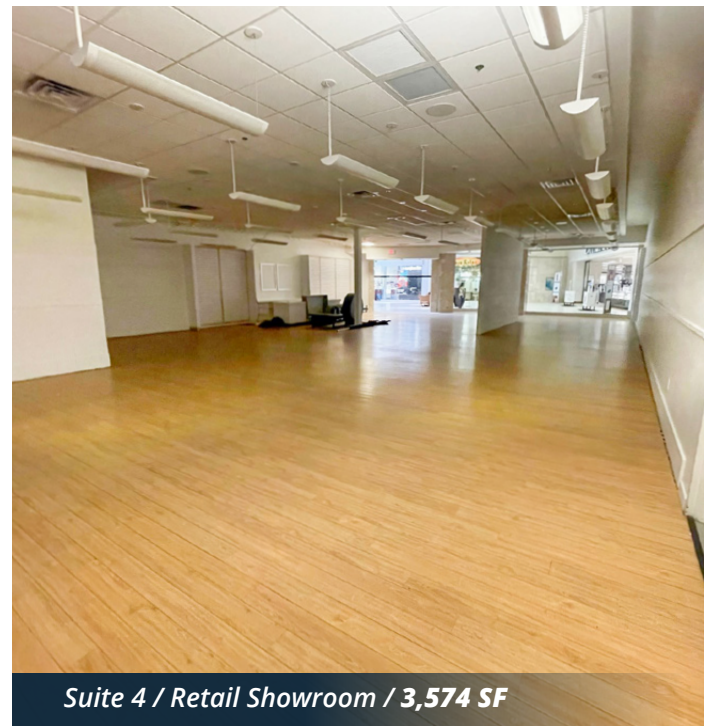
Suite 4 / Retail Showroom / 3,574 SF