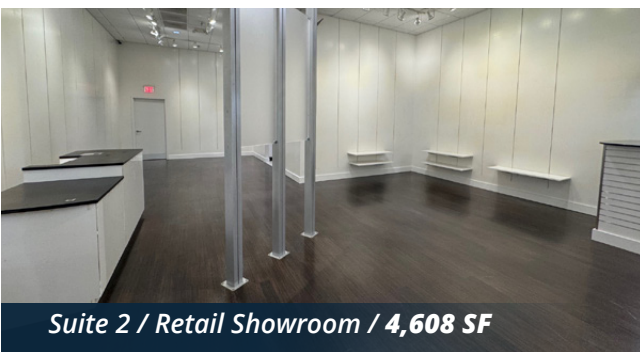
Suite 2 / Retail Showroom / 4,608 SF