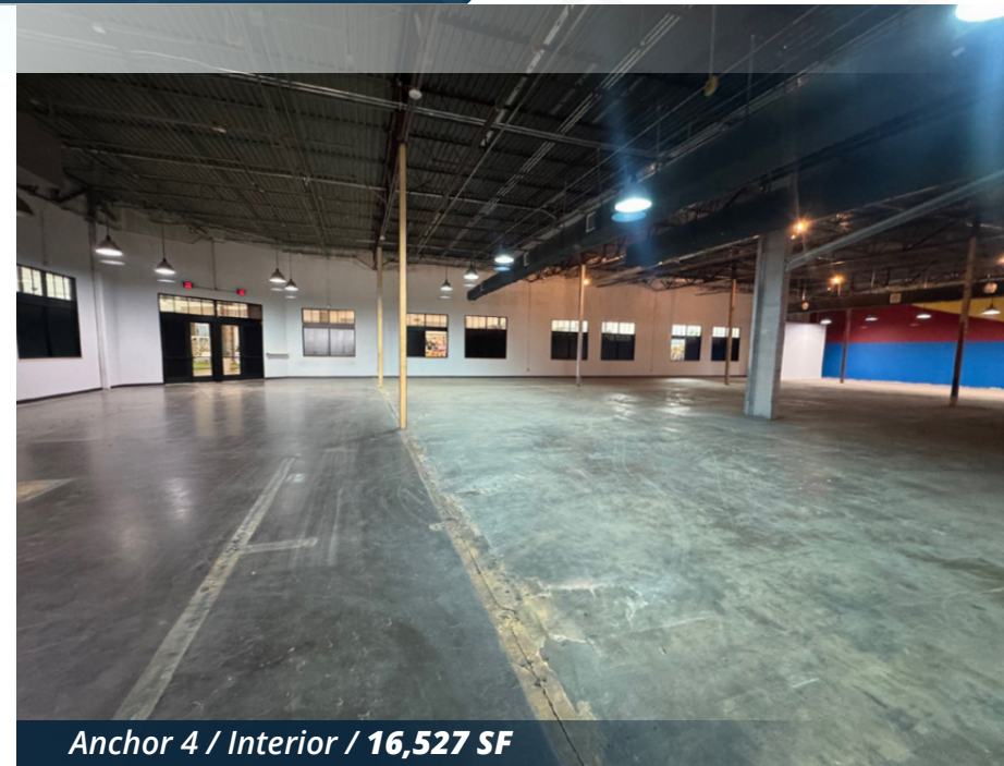
Anchor 4 / Interior / 16,527 SF