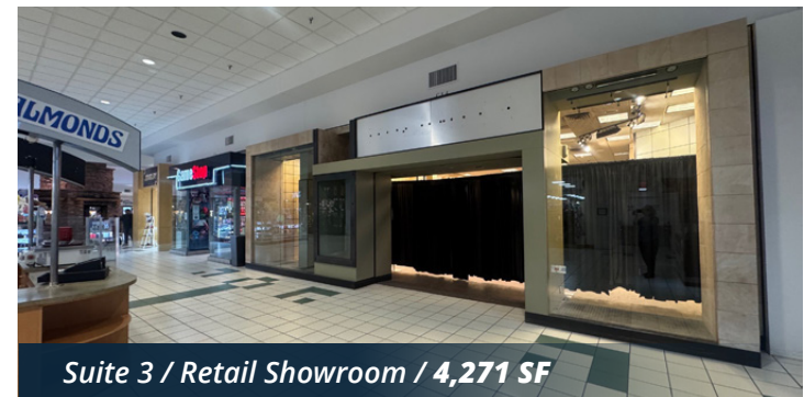
Suite 3 / Retail Showroom / 4,271 SF