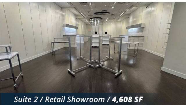
Suite 2 / Retail Showroom / 4,608 SF