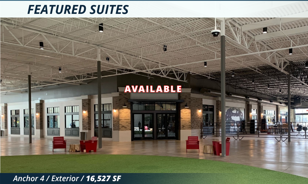
Anchor 4 / Exterior / 16,527 SF