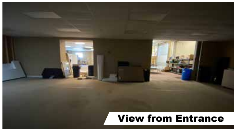
View from Entrance