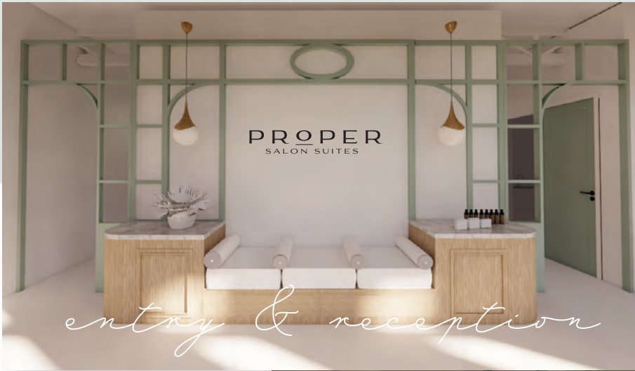
entry & reception