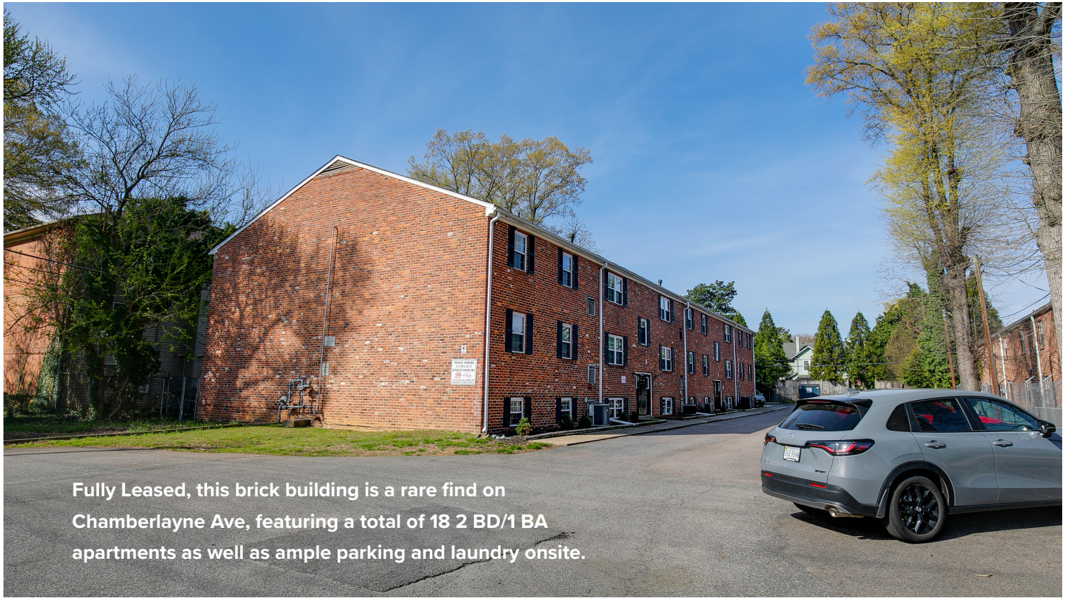
Fully Leased, this brick building is a rare find on Chamberlayne Ave, featuring a total of 18 2 BD/1 BA apartments as well as ample parking and laundry onsite.