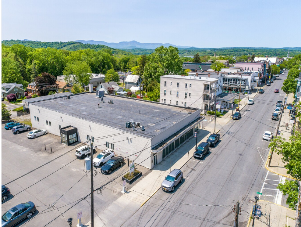
Exterior Front & East Side