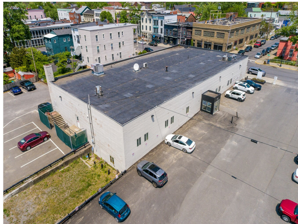
Exterior East Side & Rear