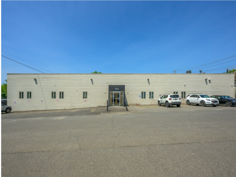
Exterior East Side