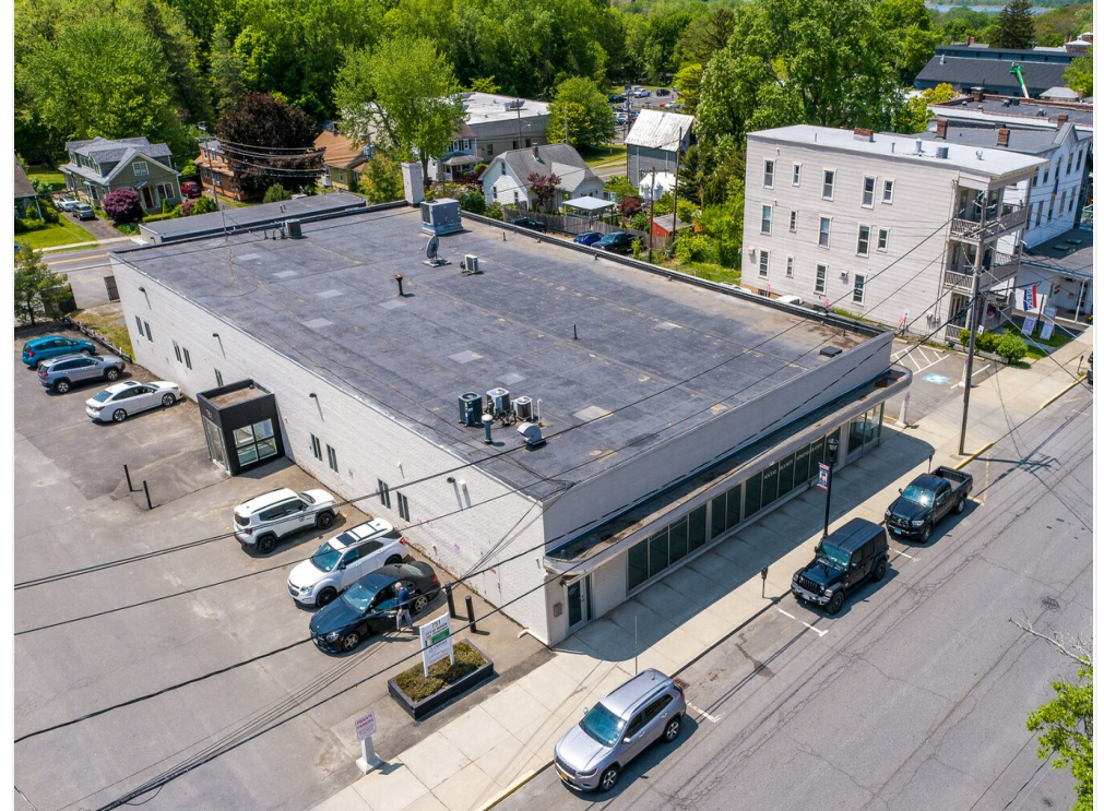
Exterior Front & East Side