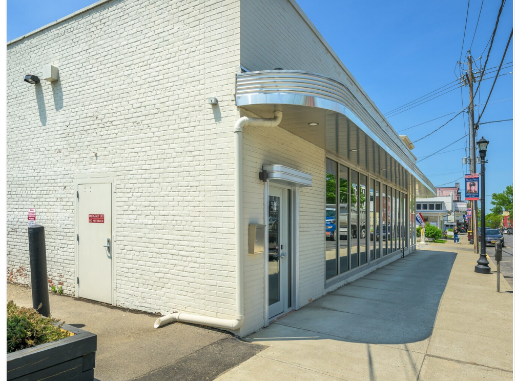
Exterior Front & East Side