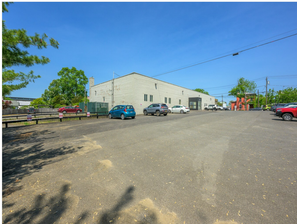
Exterior Rear & East Side