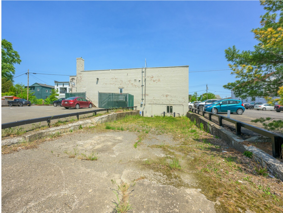
Exterior Rear (Former Loading Dock)