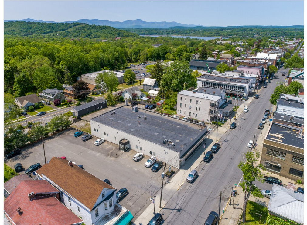
Exterior Front & East Side