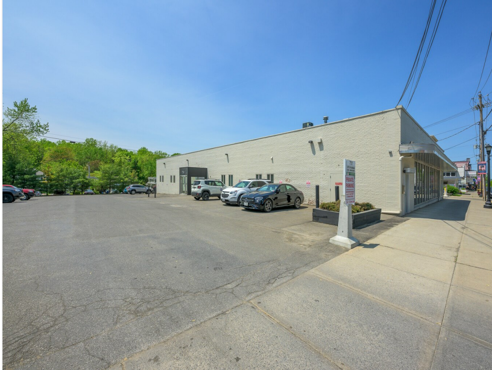
Exterior Front & East Side