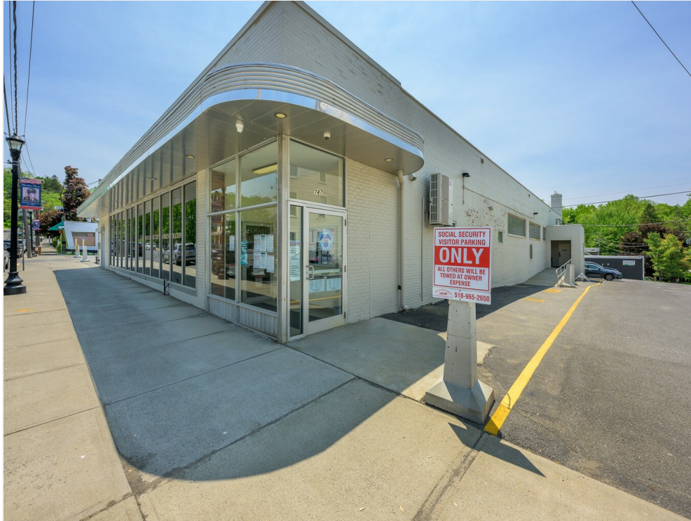
Exterior Front & West Side