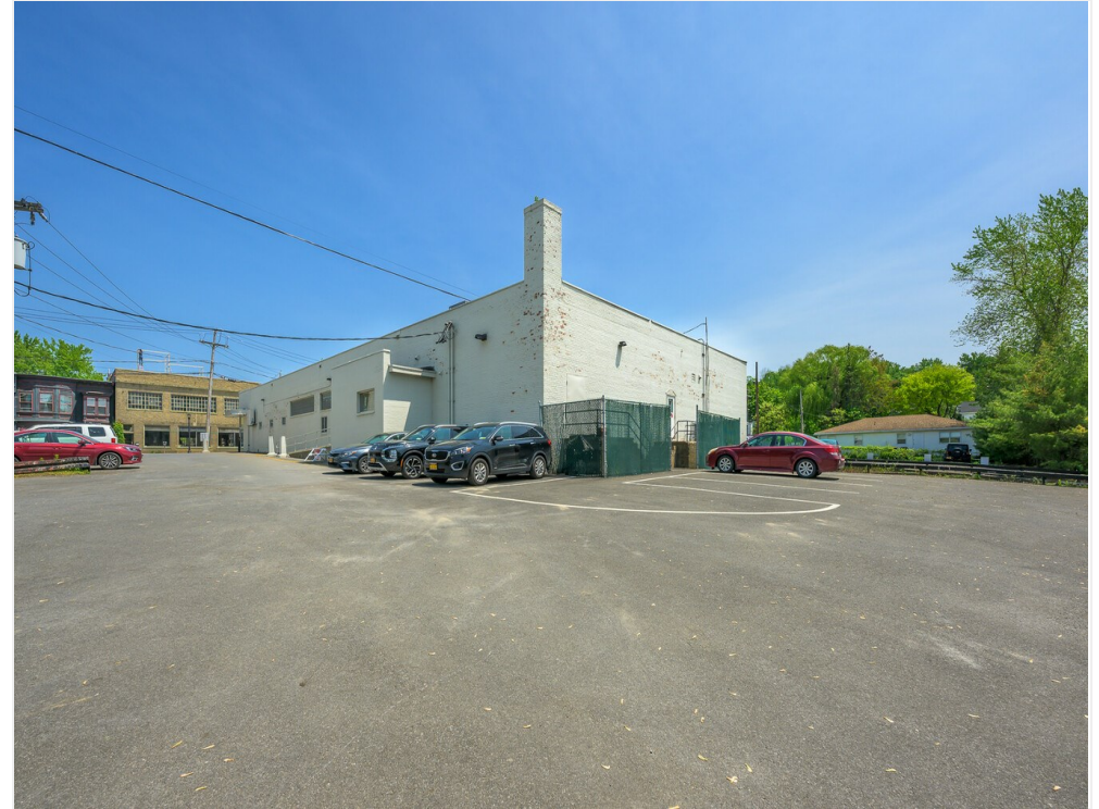
Exterior West Side & Rear