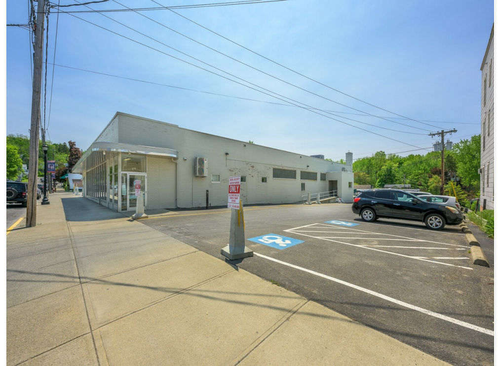
Exterior West Side & Front