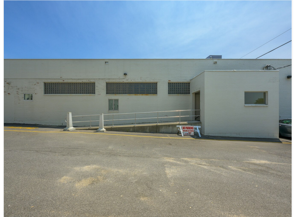
Exterior West Side