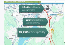
Joint Base Andrews location

Suite 100 at Branch Avenue Professional Center offers a 4,040 RSF first-floor leasing opportunity off Branch Avenue / Route 5 near Joint Base Andrews in Clinton, Maryland. Newly renovated bathrooms and lobbies, strong access, and a practical existing layout create an appealing professional setting for users seeking efficient occupancy and quality presentation.