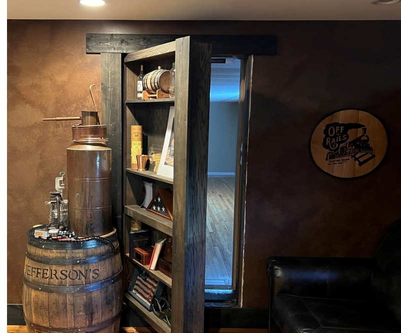
Second Floor - Bourbon Room