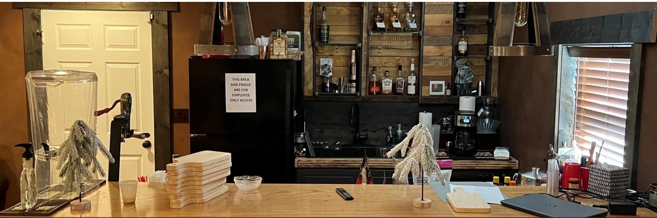
Second Floor - Wet Bar