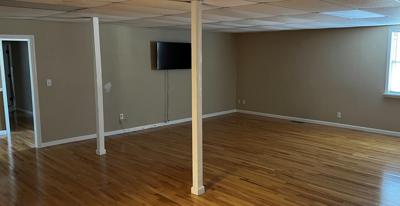
Second Floor - Event Space