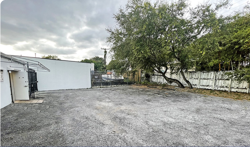
PRIVATE GATED PARKING LOT