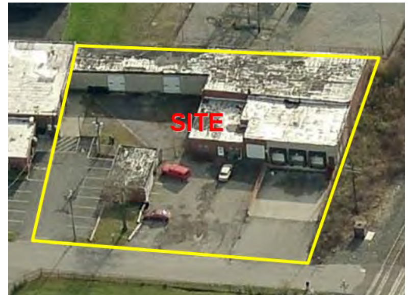
Tax Map / Aerial