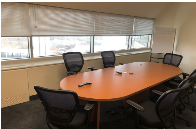
Conference Room #2