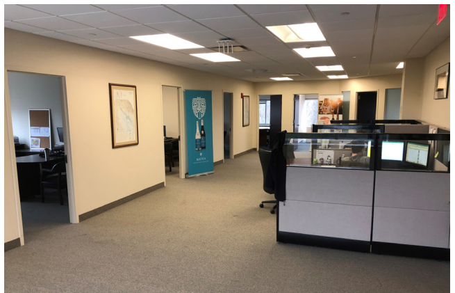
Cubicle / Open Area