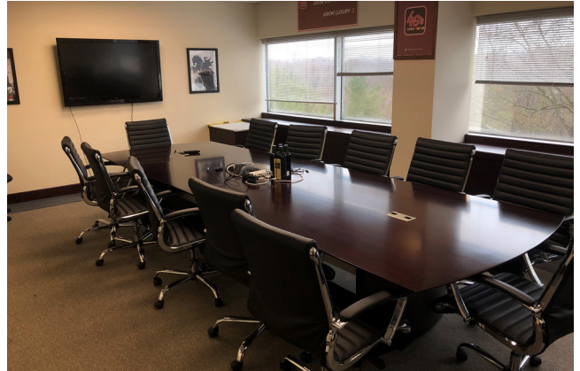
Conference Room #1