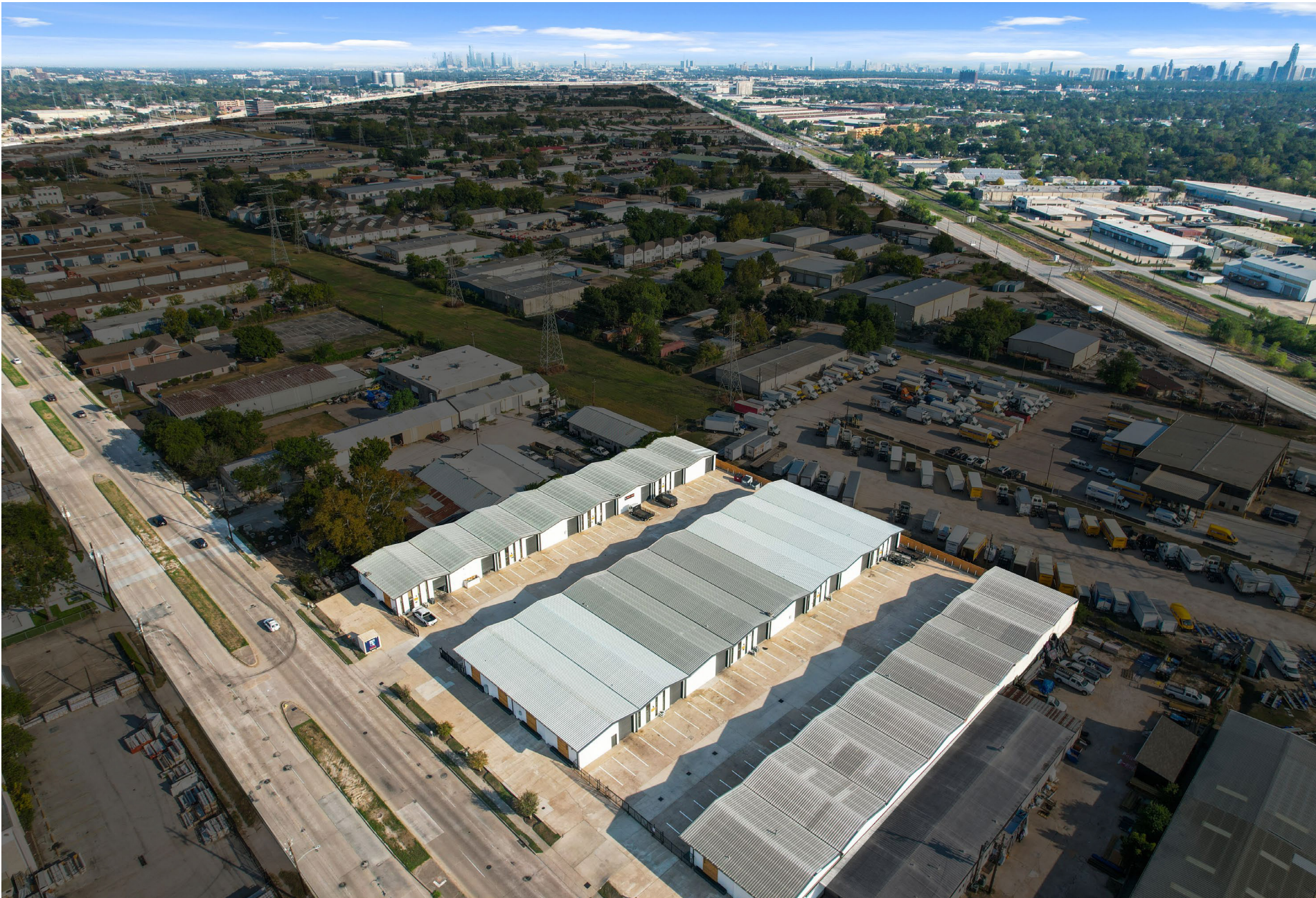
WEST 34TH ST BUSINESS PARK